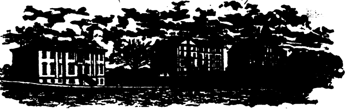
ATLANTA UNIVERSITY, ATLANTA, GA.

In all English branches, prepare you to be a good teacher, carry you through a regular college course and graduate you