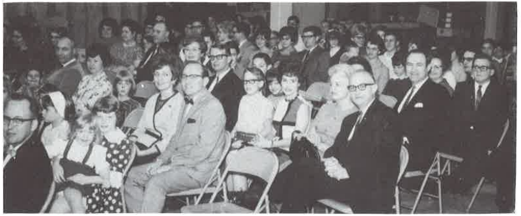
Shown above, enjoying an evening together, is a part of the ever-growing MCC Staff and Faculty Family.