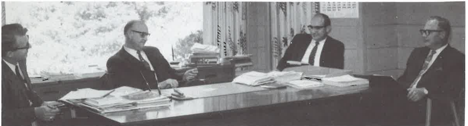
The Administrative Council of the college meets often to initiate programs in various departments to promote continued growth and development of the college for greater service to the student.