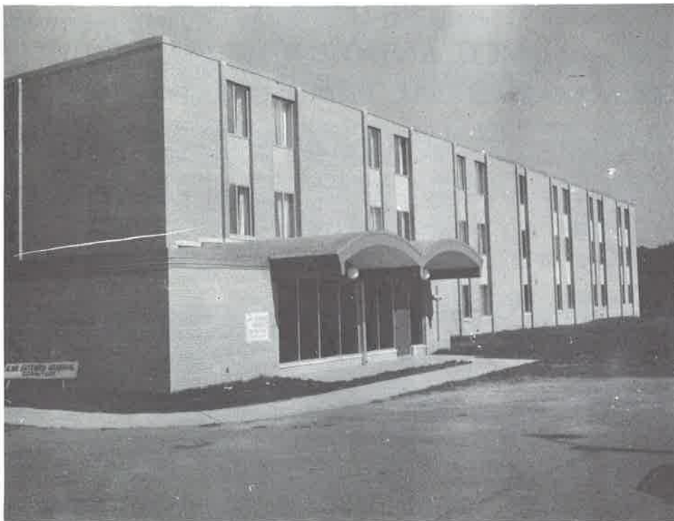
Alma Gatewood Memorial Women's Dormitory