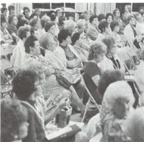
Monthly Meetings - Chapter Meetings The first Tuesday night in each month the Associates hold lively meetings. Individual chapters also hold their own meetings.