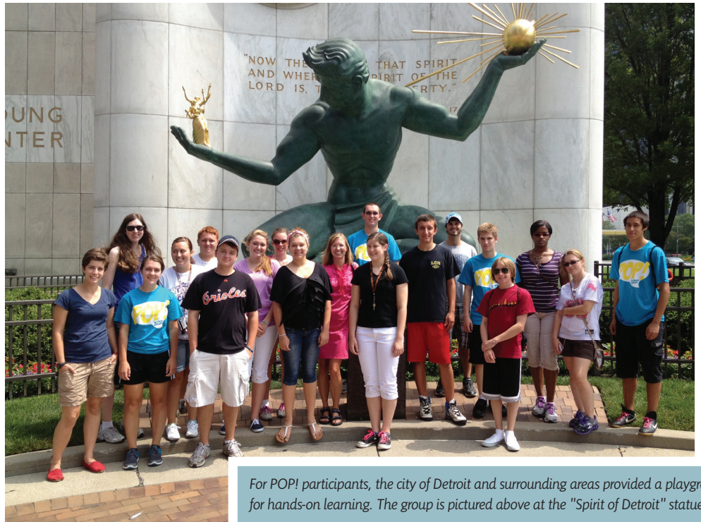
For POP! participants, the city of Detroit and surrounding areas provided a playground for hands-on learning. The group is pictured above at the "Spirit of Detroit" statue.