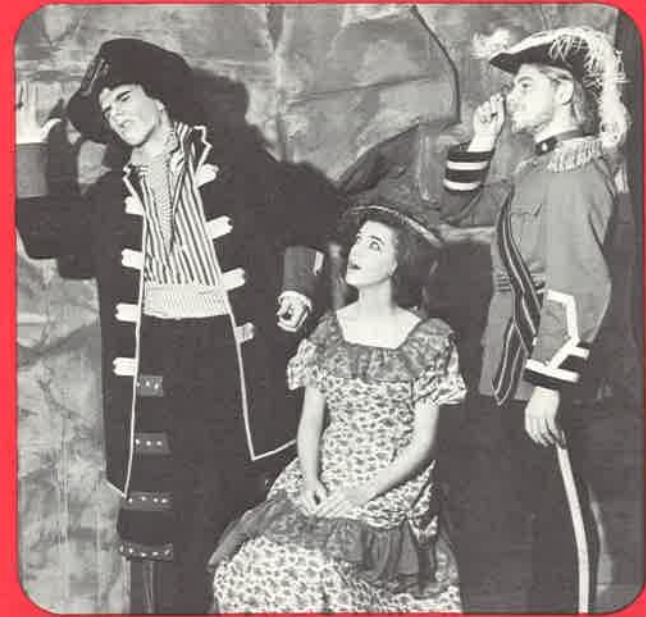
That "Added Something" which makes the Well-Balanced Student