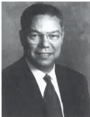
Colin L. Powell (Retired)

General Colin L. Powell, USA (Ret.) is the author of his best-selling autobiography, My American Journey , which traces his life from his birth to immigrant Jamaican parents in Harlem, to his role in advising this country's three most recent chief executives, Presidents Reagan, Bush and Clinton.