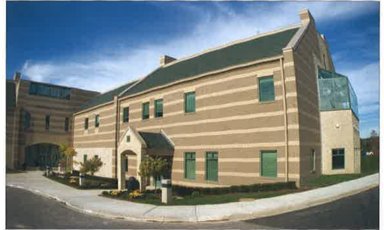
The newest addition to the Rochester College skyline: the Richardson Academic Center, dedicated October 1, 2004. The RAC houses administrative offices, a theatre, student center, science and psychology labs and classrooms, and the ACE Lab. It is attached to the east end of the Ham Library, which opened in the fall of 2002.

Since its inception, Rochester College has emphasized the importance of combining academic excellence with Christian ideals. While the College admits students of all